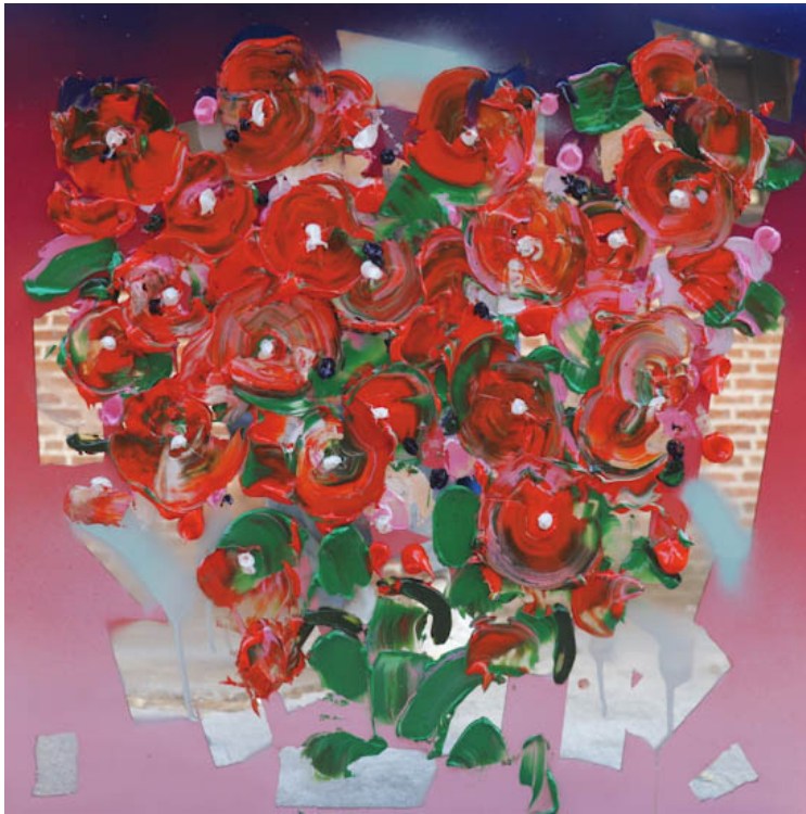
"Poppies #1" by Edward Granger, 2018. Gunpowder paint on mirror, oil paint.