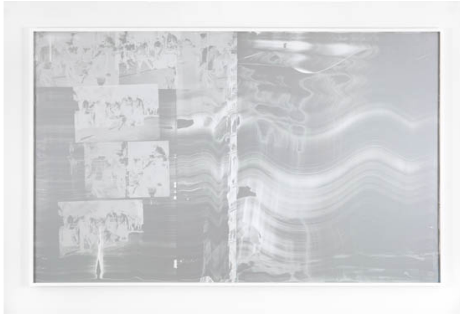
HANK WILLIS THOMAS, "Race Riot (With Interference)," 2017. Screenprint on retroreflective vinyl, mounted on Dibond. Diptych: 60 x 96 inches (prints), 60 3/4 x 97 1/4 x 1 3/4 inches (framed). © Hank Willis Thomas. Courtesy of the artist and Jack Shainman Gallery, New York.

Click here ( http://www.jackshainman.com/artists/hankwillis-thomas/ ) for exhibition details.